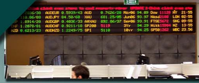
1. Westpac Sydney Head Office LED Financial Trading Board