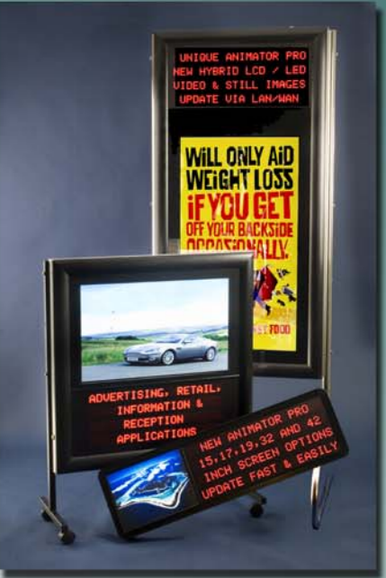
10. AnimatorPRO Family