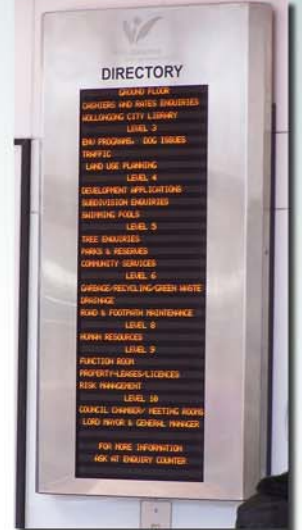
5. Wollongong LED Building Directory System