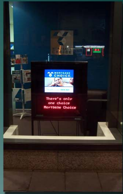
8. Mortgage Choice AnimatorPRO