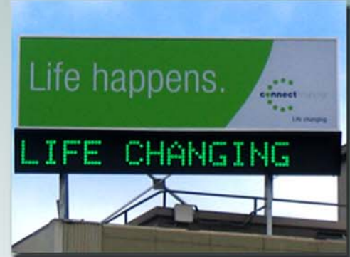
3. Connect Finance (Hobart) Scrolling Billboard Display