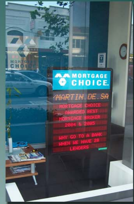
7. Mortgage Choice Vision Viewer

For further information and an obligation free proposal contact: Phone: 1300 888 506 Email: sdsales@computronics.biz