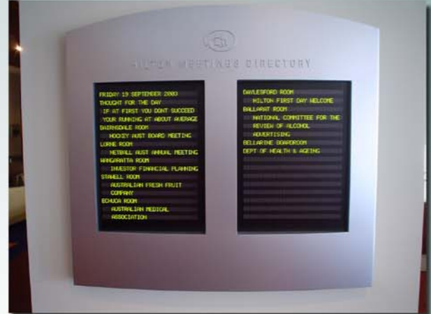
6. Hilton Meeting Directory System

Computronics has a variety of flexible LED, LCD and Plasma display solutions for the Finance Industry.