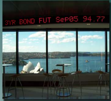
2. Bloomberg Sydney, Scrolling Financial Ticker