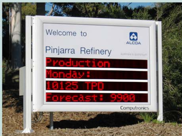
Pinjarra Refinery Safety Board - Installed 2005